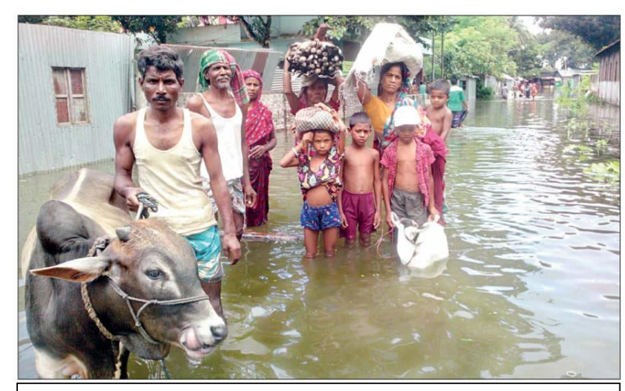
Photo: People including women and children are moving for a safe place, Chukainagar Union, Dewnganj, Jamalpur

In public domain, roads, culverts, embankment have been damaged in many